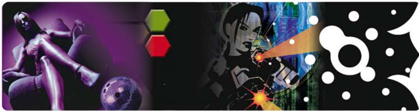
Let the battle begin... M9 Laser Skirmish