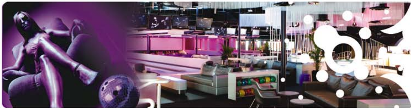
Venue picture of Kingpin Darling Harbour