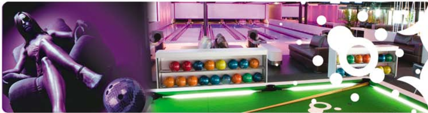
Pool tables & lanes at Kingpin Darling Harbour