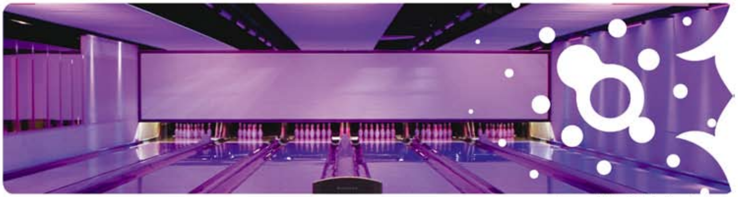
Lanes at Kingpin Darling Harbour